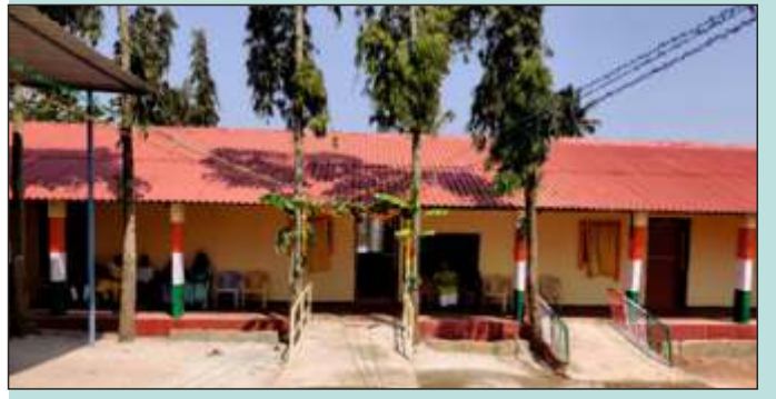
Government School, Nandi, Chickaballapura Taluk