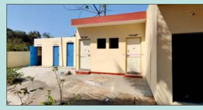
Government School, Byranahalli, Nelamangala Taluk