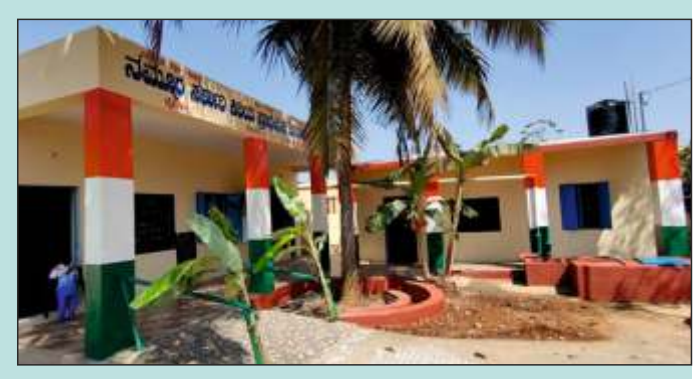
Government School, Byranahalli, Nelamangala Taluk