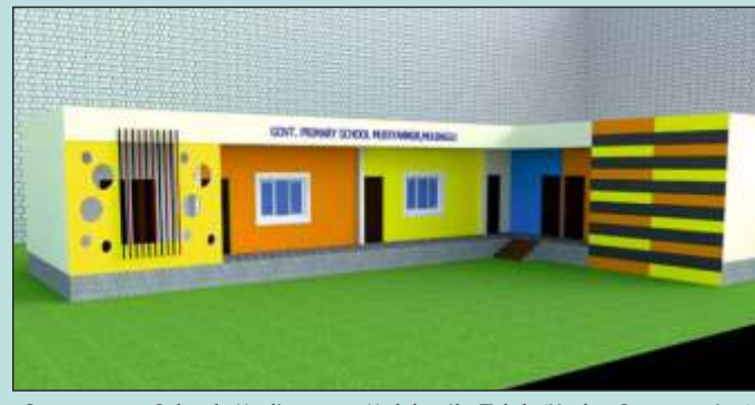
Government School, Mudiyannur, Mulabagilu Taluk (Under Construction)